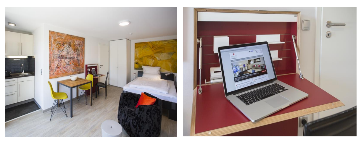
living / sleeping