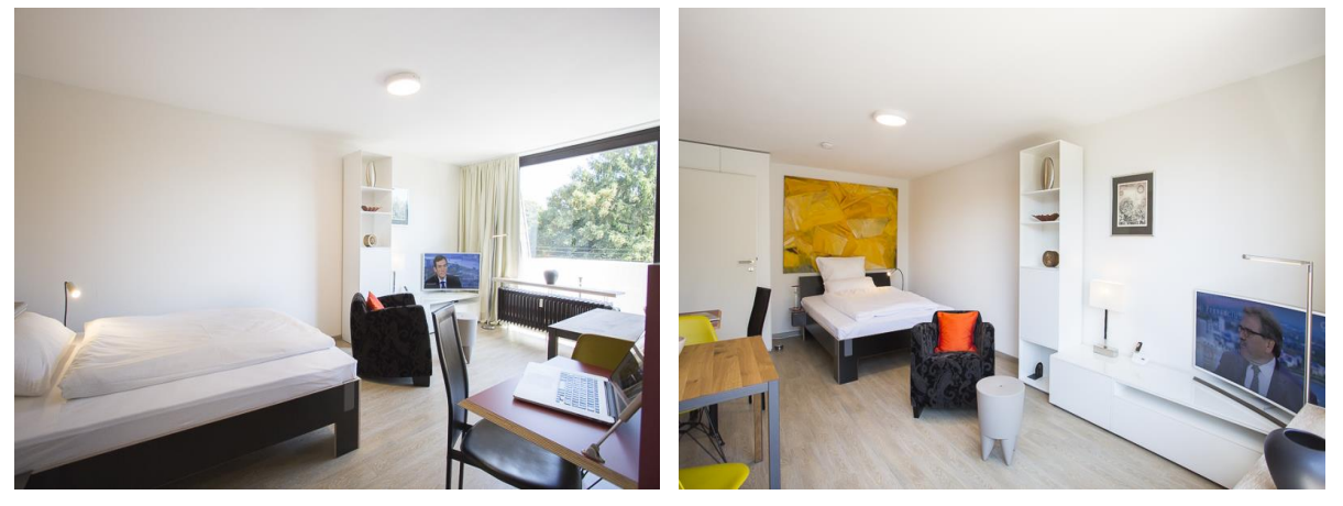
living / sleeping