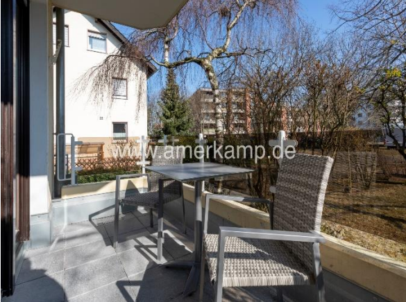
balcony (entrance sleeping)