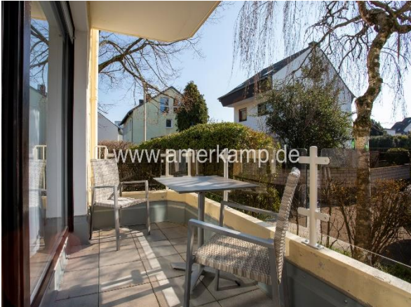
balcony (entrance living)