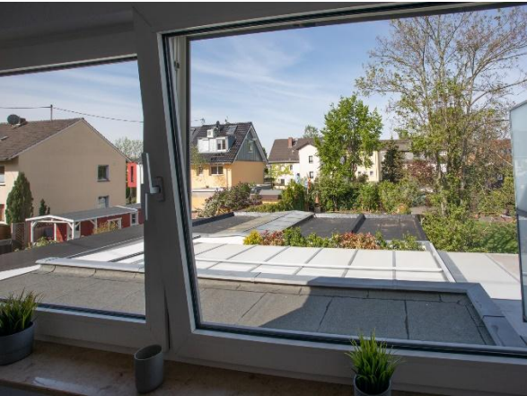
Living - view