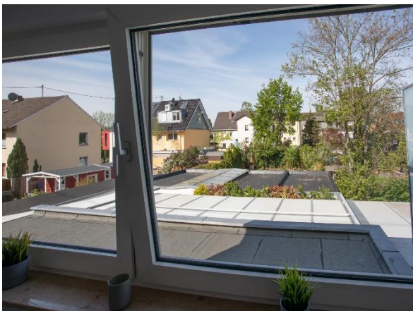
Living - view